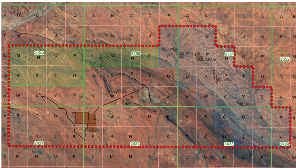
Figure 1: Map showing proposed subdivision of EL22349. The blue shaded area is to be subdivided and transferred to Tivan as part of the acquisition; Tivan has rights to explore for fluorite in the green shaded area.

Additionally, the parties have agreed to the key terms of a “Mineral Sharing Agreement” that recognises the mutually exclusive mineral focus of the respective companies. The Mineral Sharing Agreement will allow Tivan to explore for fluorite in an area along the northern boundary of EL22349 (green area in Figure 1) outside of the acquisition area and allows the joint venture partners to explore for minerals other than fluorite on Tivan’s acquired tenements (blue area in Figure 1) (both rights subject to standard operational non-interference provisions).