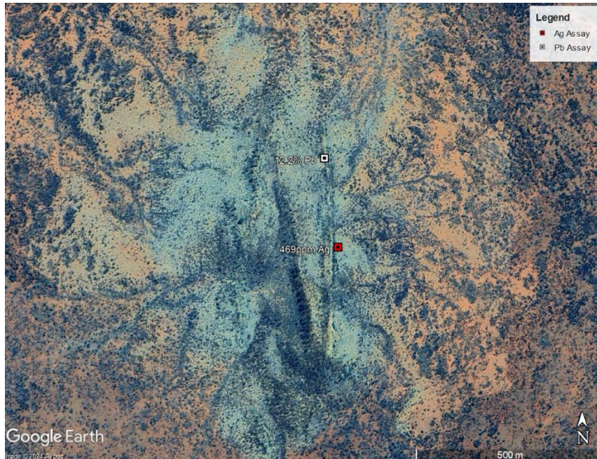
Figure 3: Image showing location of newly identified high-grade silver assay relative to high-grade lead assay, located along North-South extruding ridge line.