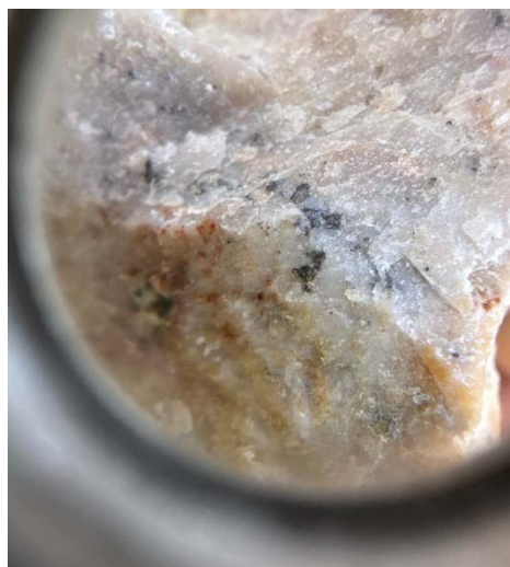
Figure 4: High-grade silver sample ESA2403095 (magnification 10x).

ASX Compliance Note: Rock chips are random, subject to bias and often unrepresentative for the typical widths required for economic consideration. Measures specified in ASX LR 5.7 relating to drill-hole collar, dip and azimuth are not relevant for surface sampling.